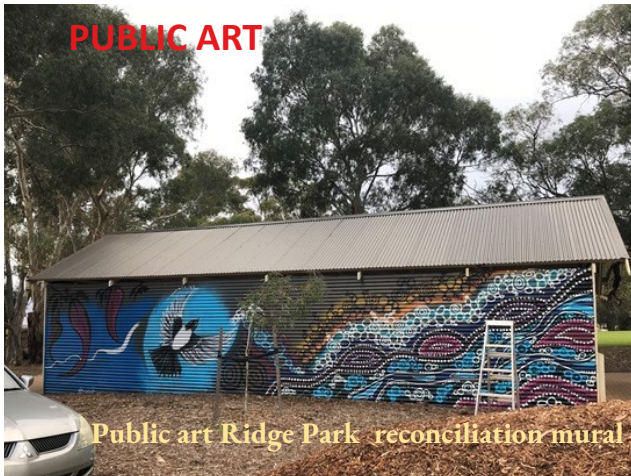
Public art Ridge Park reconciliation mural

We received $15,000 from Arts SA to increase our $50,000 budget for a number of public art works across Unley. The mural at Ridge Park is receiving a lot of positive feedback, especially compared to a very public corrugated iron shed. Love your feedback... at $6,000, do you like this piece? Are you pleased that Unley is installing Public art?